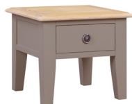
LAMP TABLE | NWXF P08 L550mm x W550mm x H485mm