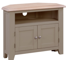
CORNER TIVI | NWXF P21 L800mm x W400mm x H635mm