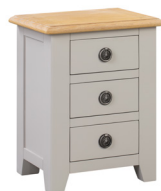
BEDSIDE 3 DRAWERS | NWXF P03 L470mm x W370mm x H605mm