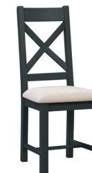
CROSS BACK CHAIR FABRIC SEAT SET UP | NWXF P35FA L440mm x W445mm x H1050mm