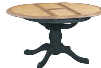
ROUND PEDESTAL DINING TABLE | NWXF P63 L1100-1450mm x W1100mm x H755mm

PLEASE NOTE THAT COLOURS/FINISHES SHOWN IN THIS BROCHURE ARE INTENDED AS A GUIDE ONLY. JTW PRODUCT RESERVES THE RIGHT TO CHANGE ANY PRODUCT AND SPECIFICATIONS GIVEN IN THIS BROCHURE.