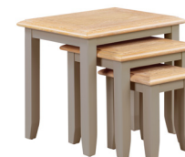
NEST OF 2 TABLE | NWXF P23 L540mm x W370mm x H485mm