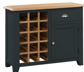
SMALL WINE RACK | NWXF P54 L970mm x W400mm x H795mm