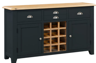
LARGE WINE RACK | NWXF P53 L1370mm x W400mm x H795mm