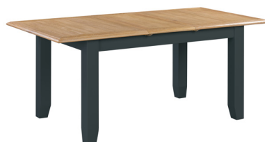
SMALL EX DINING TABLE | NWXF P18 L1200-1500mm x W850mm x H765mm