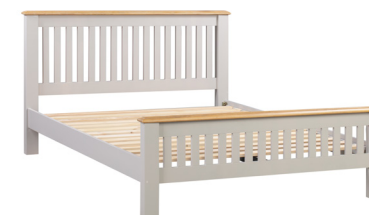
NEW HIGH END BED 6' | NWXF P41 L1940mm x W2170mm x H1050mm

PLEASE NOTE THAT COLOURS/FINISHES SHOWN IN THIS BROCHURE ARE INTENDED AS A GUIDE ONLY. JTW PRODUCT RESERVES THE RIGHT TO CHANGE ANY PRODUCT AND SPECIFICATIONS GIVEN IN THIS BROCHURE.