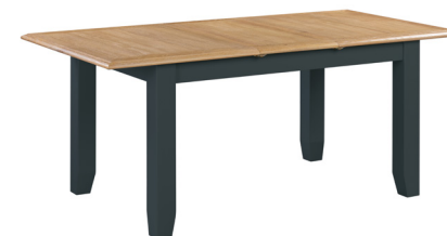
MEDIUM EX DINING TABLE | NWXF P19 L1400-1800mm x W900mm x H765mm