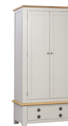
DOUBLE WARDROBE | NWXF P12 L900mm x W560mm x H1870mm