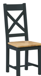
CROSS BACK CHAIR FIXED WOODEN SEAT | NWXF P35WD L440mm x W445mm x H1050mm