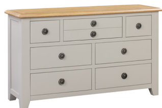
CHEST 3 OVER 4 | NWXF P10 L1280mm x W400mm x H765mm