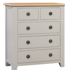
CHEST 2 OVER 3 | NWXF P11 L850mm x W400mm x H945mm