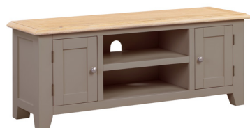
LARGE TIVI | NWXF P24 L1200mm x W370mm x H485mm