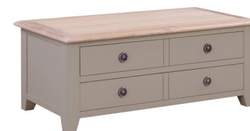
STORAGE COFFEE TABLE | NWXF P56 L1200mm x W600mm x H485mm

PLEASE NOTE THAT COLOURS/FINISHES SHOWN IN THIS BROCHURE ARE INTENDED AS A GUIDE ONLY. JTW PRODUCT RESERVES THE RIGHT TO CHANGE ANY PRODUCT AND SPECIFICATIONS GIVEN IN THIS BROCHURE.