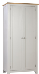
FULL WARDROBE | NWXF P13 L900mm x W560mm x H1885mm