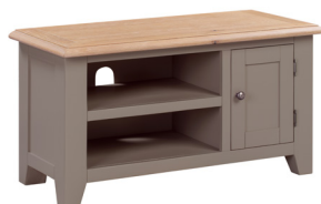
SMALL TIVI | NWXF P22 L910mm x W370mm x H485mm