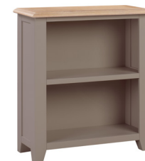
LOW BOOKCASE | NWXF P17 L800mm x W320mm x H885mm