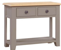
CONSOLE TABLE 2 DRAWERS | NWXF P14 L850mm x W340mm x H685mm