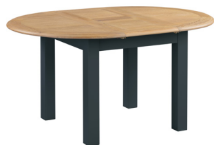
ROUND DINING TABLE | NWXF P31 L1100-1500mm x W1100mm x H765mm