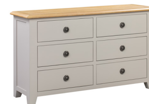
CHEST 6 DRAWERS | NWXF P09 L1280mm x W400mm x H765mm