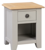
SMALL BEDSIDE 1 DRAWERS | NWXF P02 L440mm x W370mm x H545mm