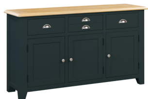
3 DOORS 3 DRAWERS SIDEBOARD | NWXF P05 L1370mm x W400mm x H795mm